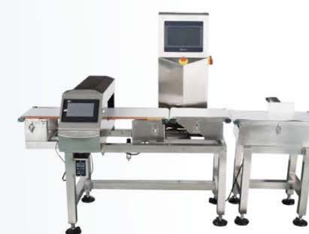
Metal Detector With Weight Selector