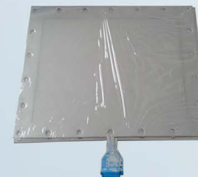
Explosion Vent Panel