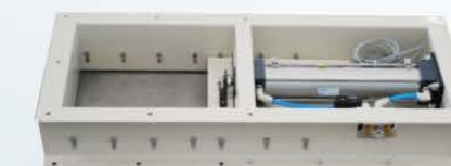
Pneumatic Slide Gate